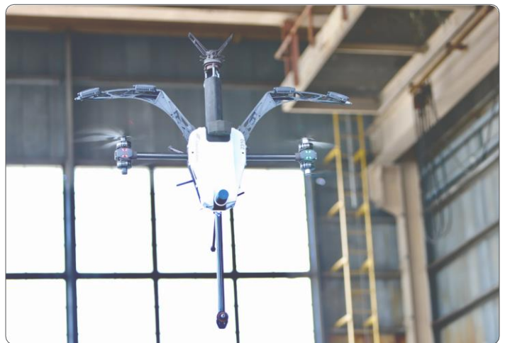
Clearsight's Drone: effortless 360-degree flying. It can maintain any angle and inspect in any direction.