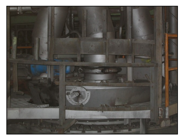
Classifier Outlet Pipes