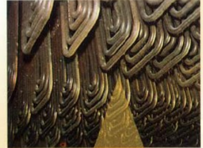
Air borne Sensor Technology