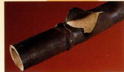
Structure borne Sensor Technol-