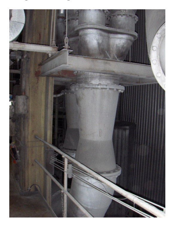
Figure 1: Original Arrangement of Nanticoke PF Distributor

A typical Nanticoke piping configuration is shown in Figure 1. The original designers of the piping obviously expected to have problems with a strong rope formation on the outer radius of the elbow. A venturi has been used in the original design with the intention of centering the rope on the splitter box as an aid to distribution. However, in practice this venturi is simply not aggressive enough to disperse the rope. Physical and computational models as well as field measurements confirm that the rope quickly reforms on the outer wall. This results in two of the four outlet pipes being heavily loaded with pulverized fuel. Table 1 shows the results of physical modeling for one of the groups of row "A. Pipes 3 and 4 in this example are located above the outer radius of the inlet pipe elbow.