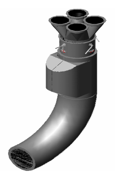
Figure 2: Configuration of H-VARB components on Nanticoke Mill 2A

The installation of the H-VARB's also included a dedicated PF-Master system (also supplied Greenbank) for monitoring pf flow conditions in the individual burner lines.